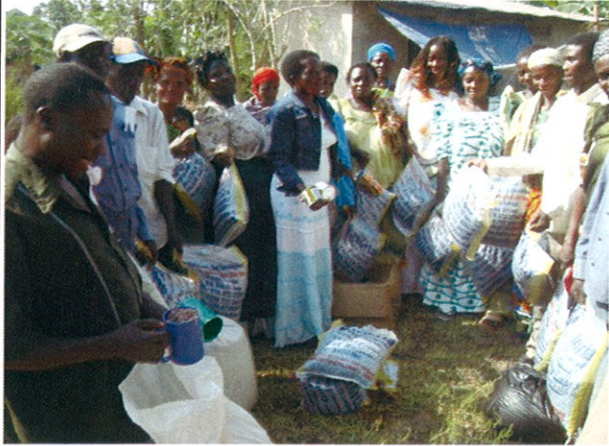
Provision of material and financial support

Photo above: Showing Group member receiving seeds and learning about the method of repayment after the harvest.