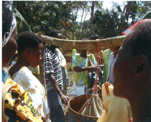
Photo: Practical training on making of organic manure