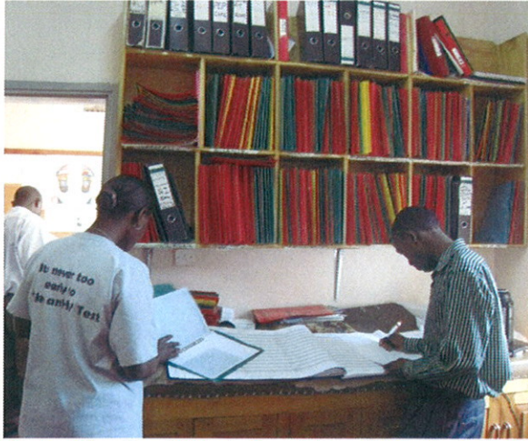
Photo; Showing HBC staff updating ART clients in the MoH monitoring tools in cohort format