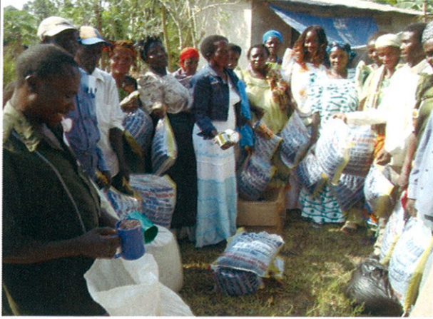
Provision of material and financial support

Photo above: Showing Group member receiving seeds and learning about the method of repayment after the harvest.