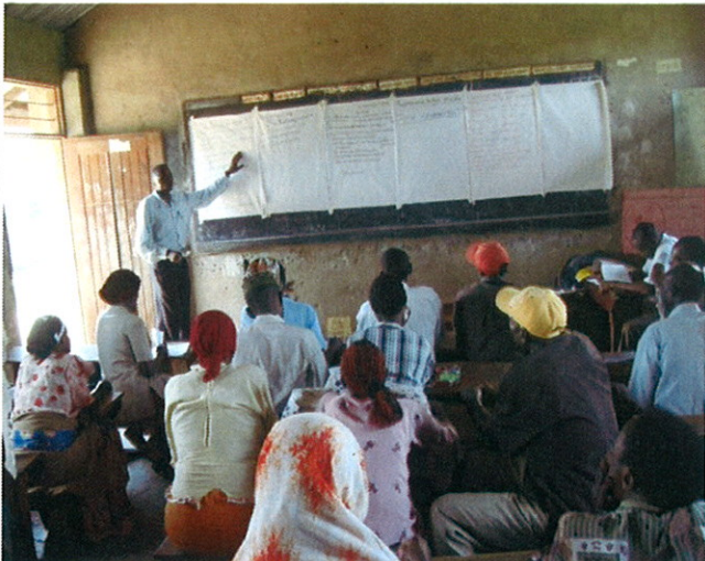
Photo above: Discussion on Gender topics – with the ART groups in Kiti, Bukulula, Classroom teaching – participative approach Below: Story telling.