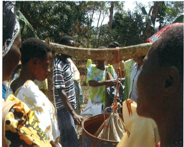
Photo: Practical training on making of organic manure