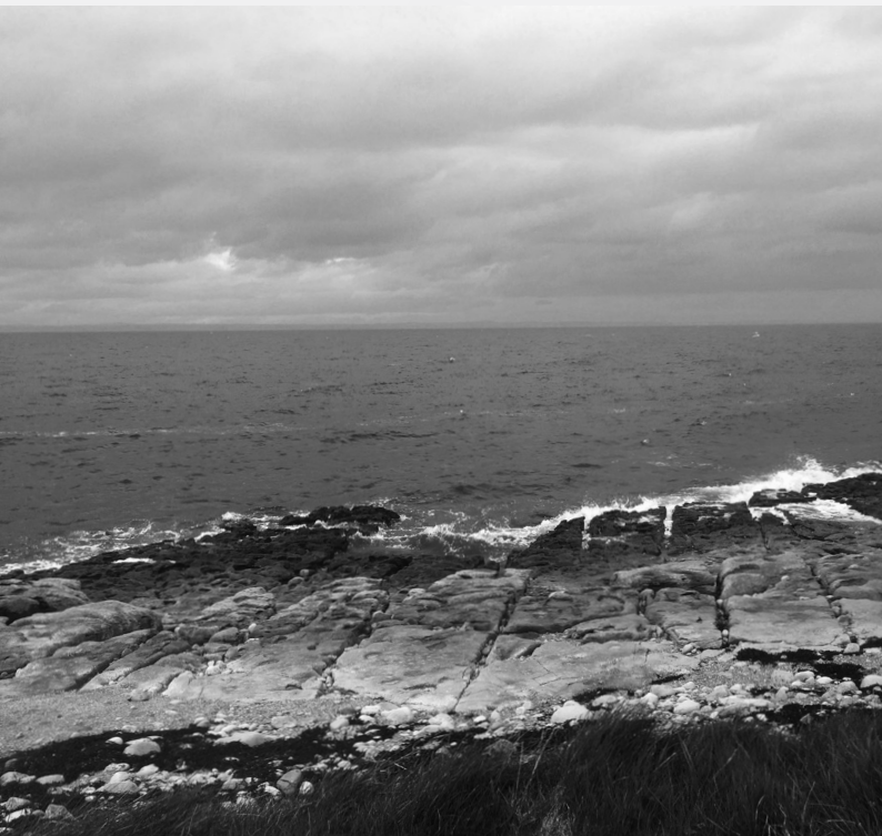
The Flaggy Shore, County Clare, Ireland