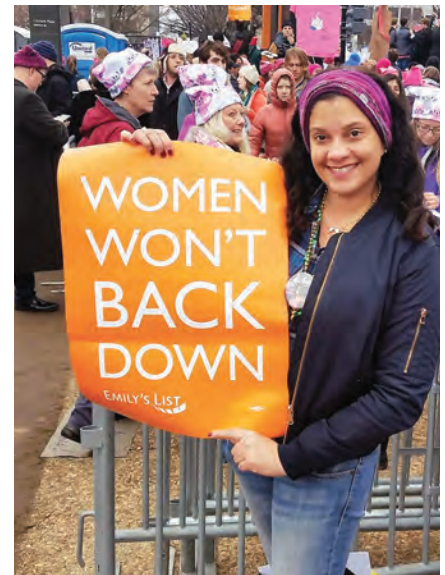
Lott Carey Photos