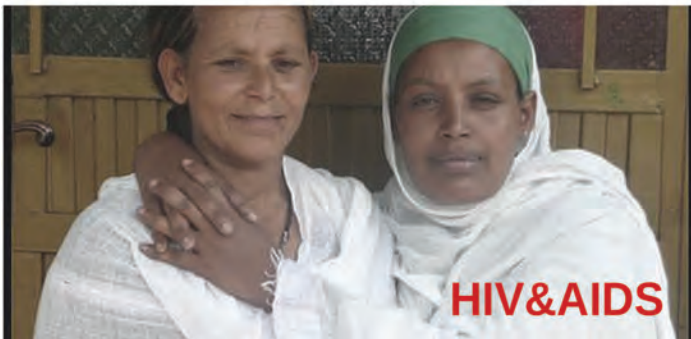
HIV & AIDS