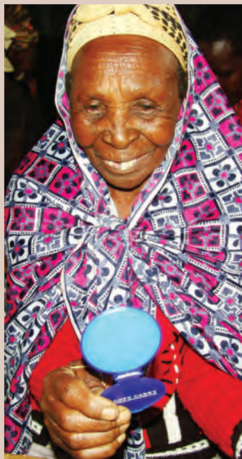
Lott Carey Photo