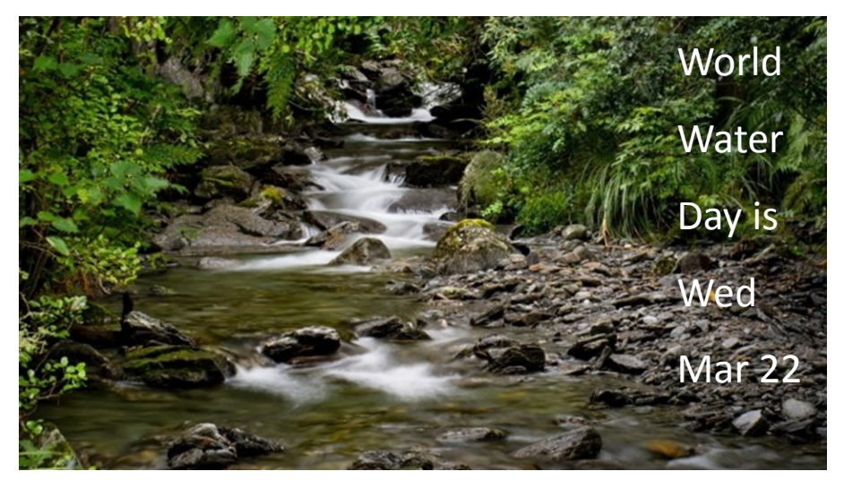
A fresh swimmable West Coast river