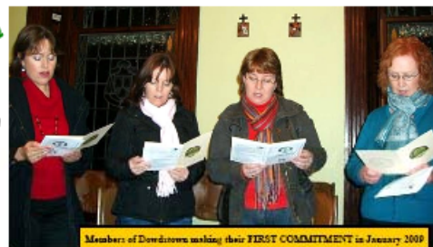
Members of Dowdstown making their FIRST COMMITMENT in January 2009

Congratulations to the four new members of Dowdstown who made their First Commitment in January 2009. We look forward to welcoming even more new members in the future.