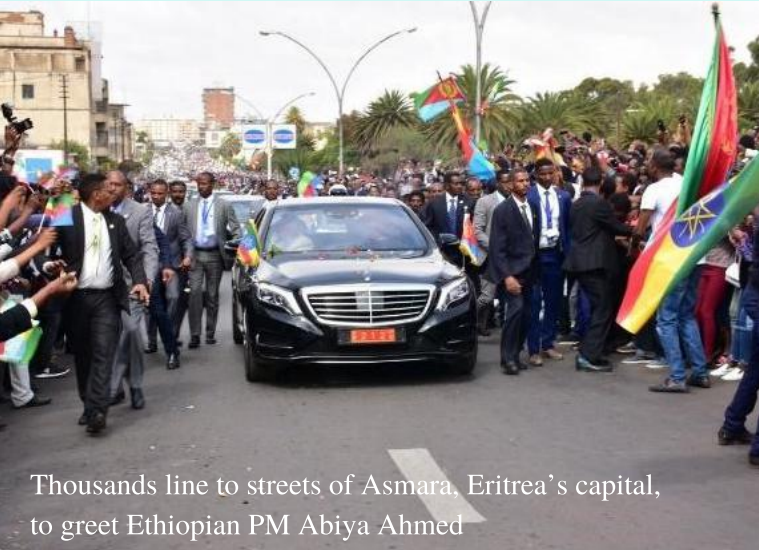
Thousands line to streets of Asmara, Eritrea's capital, to greet Ethiopian PM Abiy Ahmed

As a development agency working in Eritrea and Ethiopia, VITA was delighted to hear news that a peace agreement was signed by both countries in July, 2018, thereby officially ending the state of war between the two countries. The agreement declared by the leaders of Eritrea and Ethiopia has been followed swiftly by meaningful reengagement between the countries. These positive developments give tremendous hope for peace, stability and economic opportunity. This is especially true for Eritrea, as it had been isolated regionally and