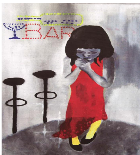
Reed & Latino "I have a voice: Trafficked Women in their own words". 2015.