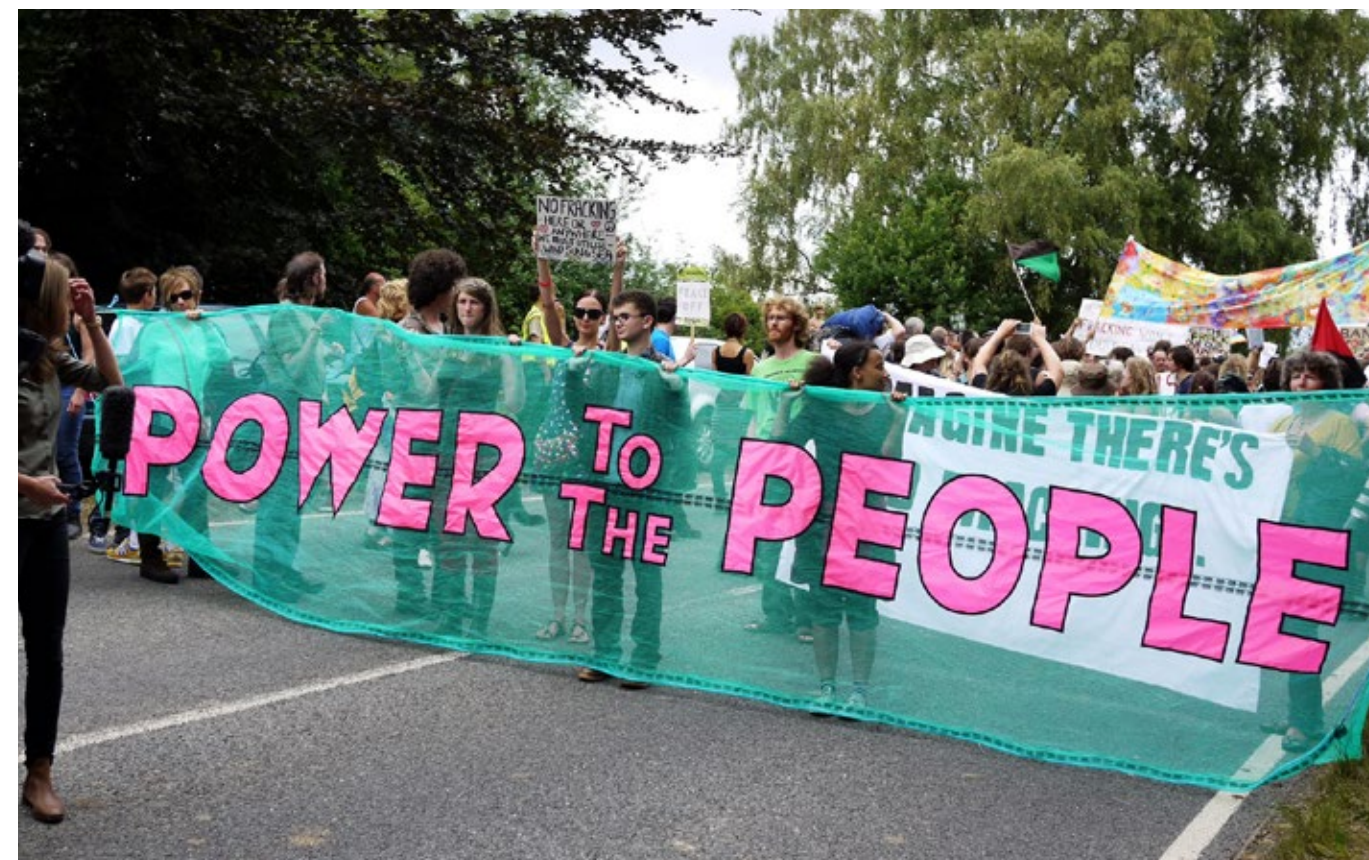
Anti-fracking campaigners at Cuadrilla drilling site at Balcombe, West Sussex.