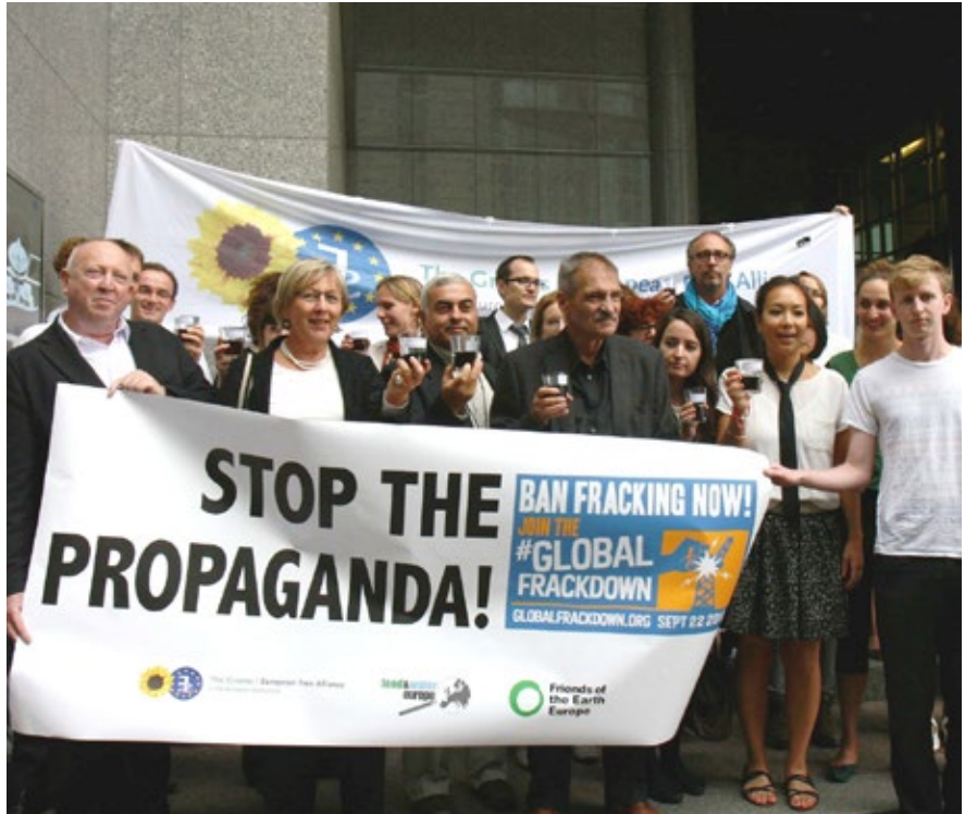
Flickr: Stop the Propoganda by greensefa, Creative Commons License

Between 2005 and 2009, the companies used 94 million gallons of 279 products that contained at least one chemical or component that the manufacturers deemed proprietary or a trade secret ... in most cases the companies stated that they did not have access to proprietary information about products they purchased “off the shelf” from chemical suppliers. In these cases, the companies are injecting fluids containing chemicals that they themselves cannot identify. 118