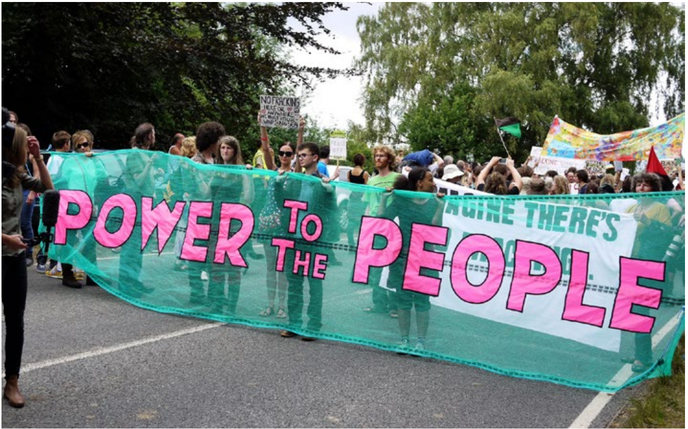
Anti-fracking campaigners at Cuadrilla drilling site at Balcombe, West Sussex.