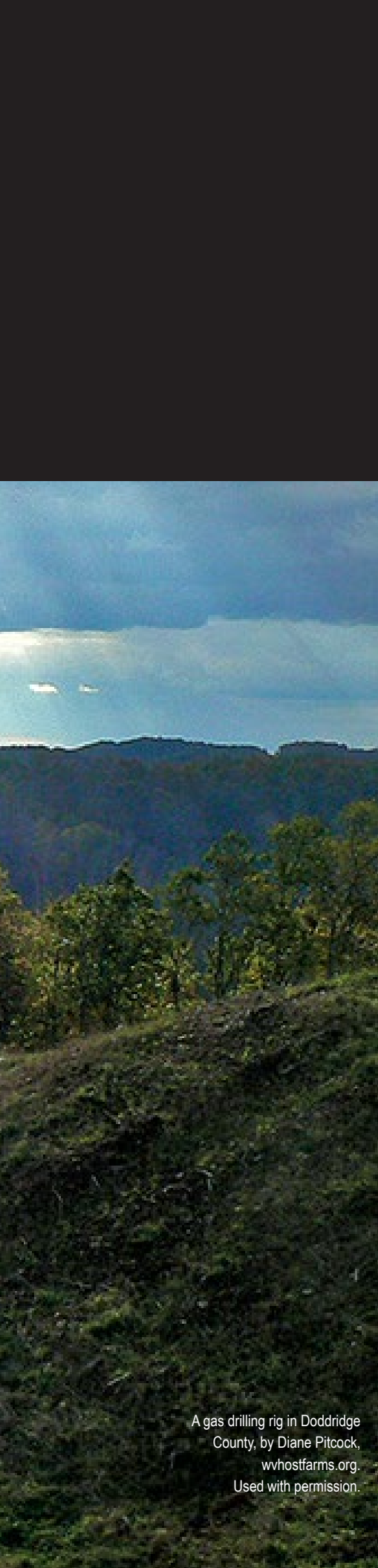
A gas drilling rig in Doddridge County

Hydraulic fracturing, or fracking, is a technique for extracting oil and natural gas. In fracking, drillers typically inject a mixture of water, proppant (often sand) and chemicals into a well at high pressure to fracture underground rock formations, unlocking trapped oil or natural gas so that it can be collected. The proppant keeps the fractures propped open so that oil and natural gas can flow into the well. 1 Chemicals are used for a variety of purposes including to reduce friction and to cause the fracking fluid to gel, enabling more proppant to be carried into the fractures. 2